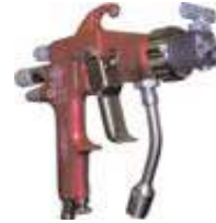
K1 3A Mix w/Reversible Tip