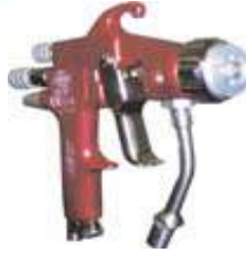
K1 3A Mix w/ Standard Tip