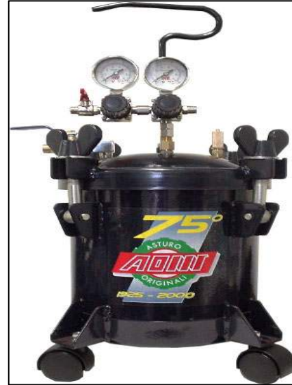
2 1/2 GAL