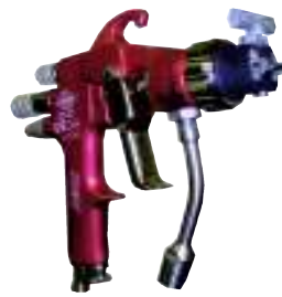
K1 3/A MIX with optional TRI-A MIX TIP (self-cleaning)

Perfect for high pressure dual kinetic or air assisted spraying operations with high viscosity coatings or when finer atomization is required. Excellent results with almost all coatings and applications including wood, metal and plastic.