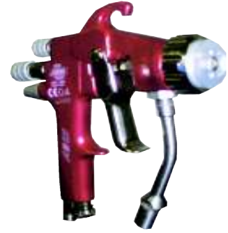
K1 3/A MIX with STANDARD TIP